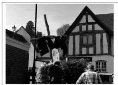
Erecting the cross on Good Friday