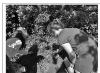
Easter Sunday Egg Hunt