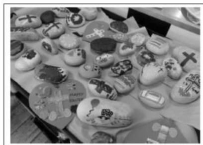
Maundy Thursday Art Works