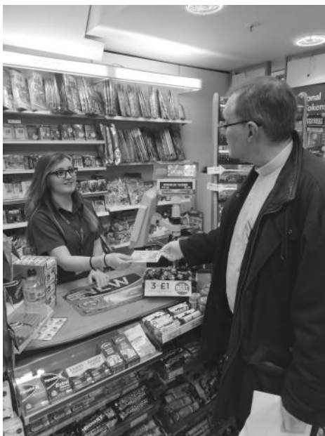
Operation Keeping in Touch

For more news of Workplace Chaplaincy in Worcestershire go to www.faithatwork.org.uk