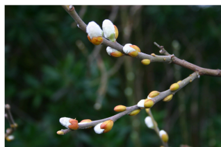
Between Waiting and Rejoicing

ST LAURENCE CHURCH, ALVECHURCH April 2025